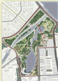
ii) Landscape and Master Plan