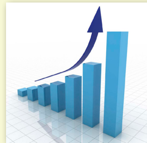
v) Financial Management and Taxation for Architects and other Professionals.