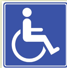
iv) Sustainable Design for Handicaps