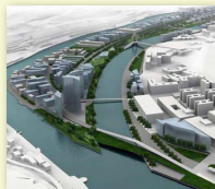
i) Conservation and Today's Architecture

We will focus our discussion on the following Topics:-