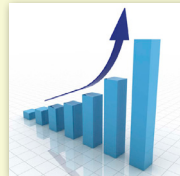
v) Financial Management and Taxation for Architects and other Professionals.