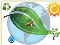
iii) Green Architecture